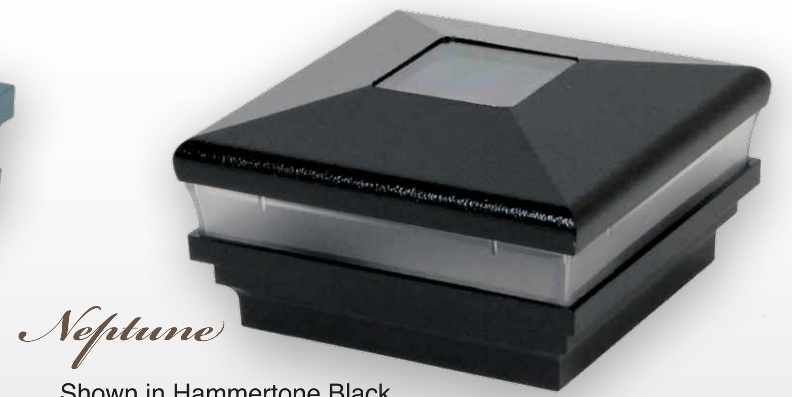
Neptune Shown in Hammertone Black