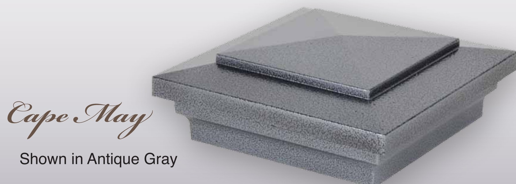
Cape May Shown in Antique Gray