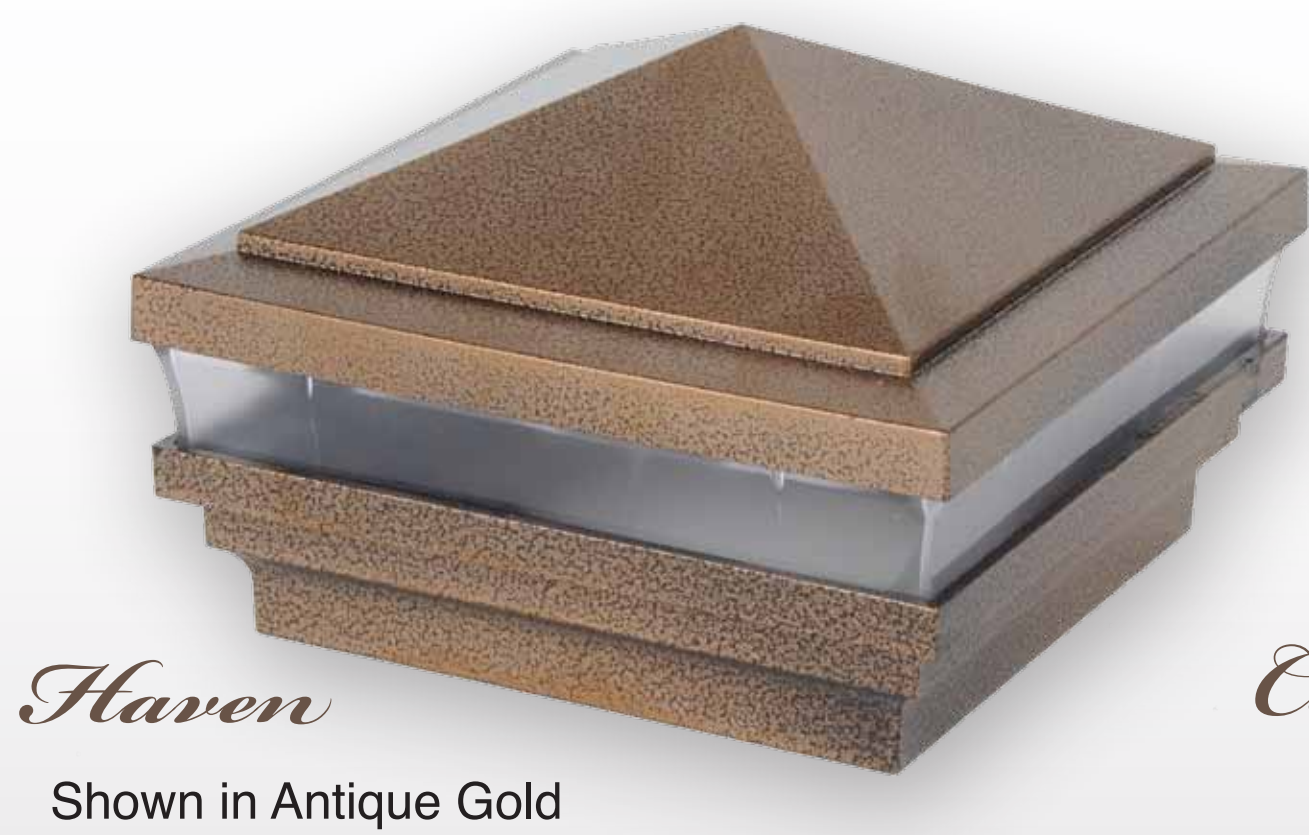
Haven Shown in Antique Gold

POST CAPS, POST SKIRTS, SOLAR & LOW VOLTAGE LIGHTING