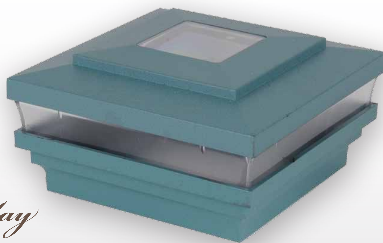
Cape May Shown in Patina